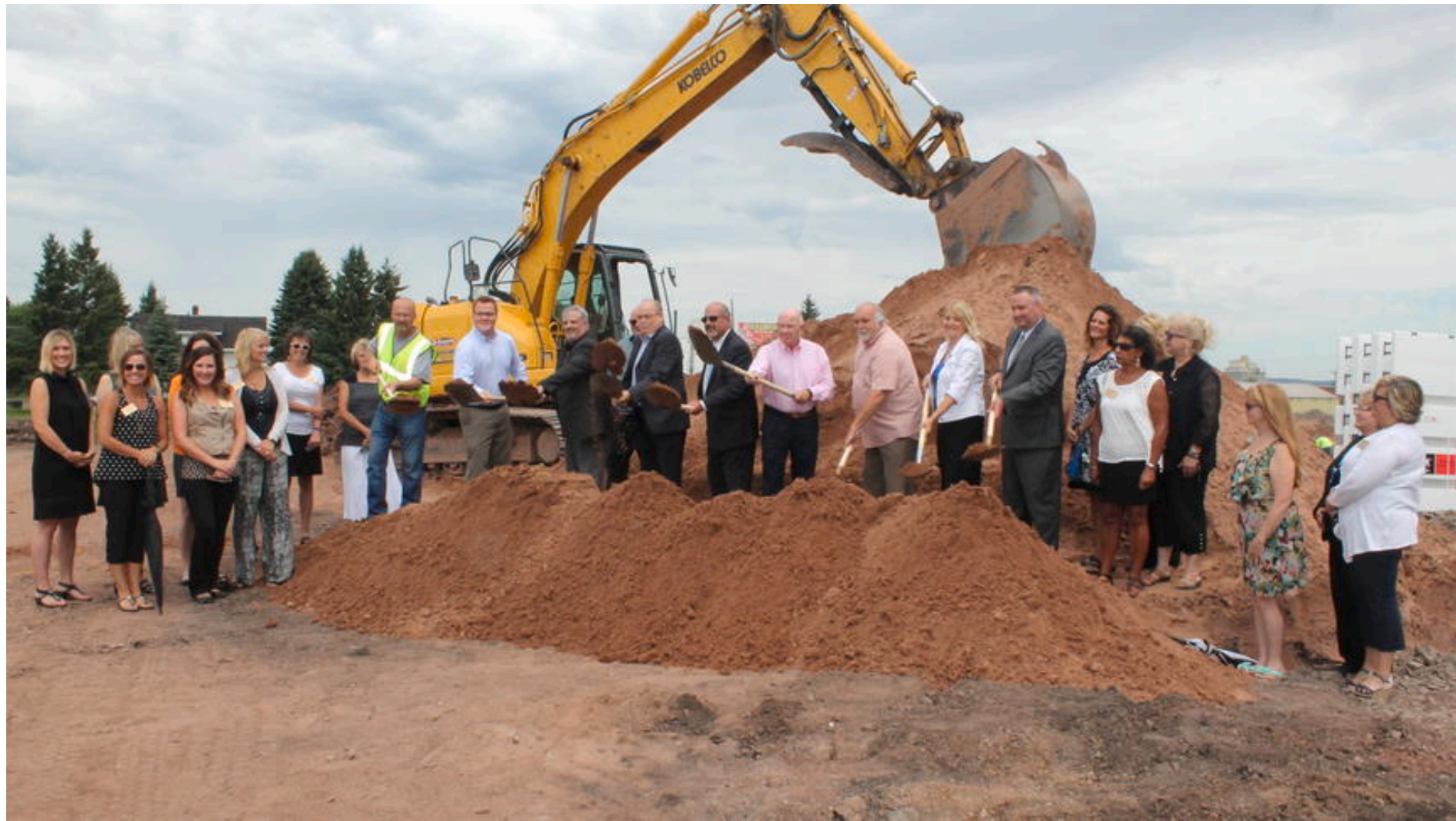
City officials and members of Oliver Companies break ground for a new Hampton Inn in Superior this morning.